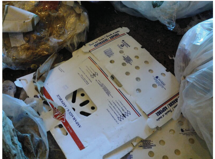
Wax plastic boxes