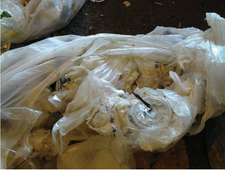
Loose film and saturation