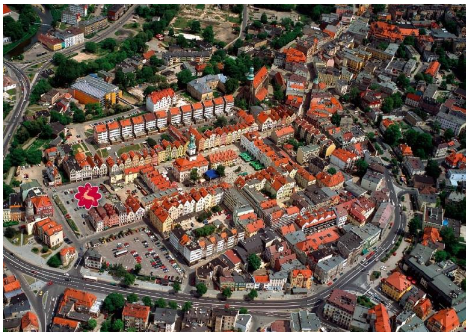
Jelenia Góra from above

http://en.jeleniagora.pl/content/welcome