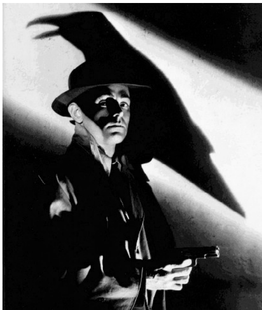
Image: Alan Ladd as The Raven in This Gun for Hire

"A Dame with a rod is like a Guy with a Knitting Needle" Out of the Past