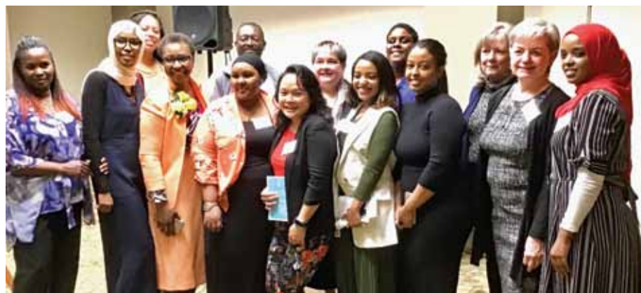
2019 MARY MAHONEY PROFESSIONAL NURSES ORGANIZATION SCHOLARSHIP RECIPIENTS AND COLLEGE OF NURSING FACULTY MEMBERS AT THE MMPNO ANNUAL BANQUET.