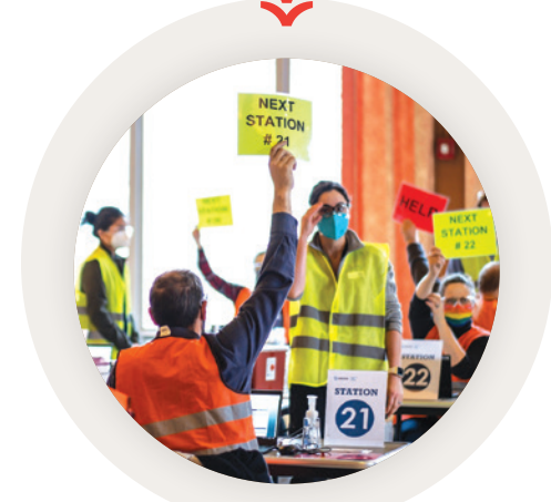
Much of the first floor of Campion Hall was home to the Swedish Community COVID-19 Vaccination Clinic at SU, a unique collaboration between the two longtime partners in health care education. The two institutions worked quickly to bring the clinic to fruition—only two weeks from decision to implementation.