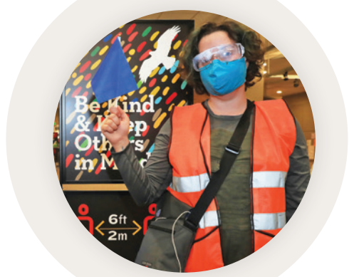
Between January 12 and February 26, 2021, Swedish administered nearly 87,000 vaccinations at its clinics in response to the state's call, with approximately 48,000 given at the SU site. Nearly one-fifth of the Swedish volunteers were affiliated with the university.

one-fifth of the Swedish volunteers were affiliated with the university.